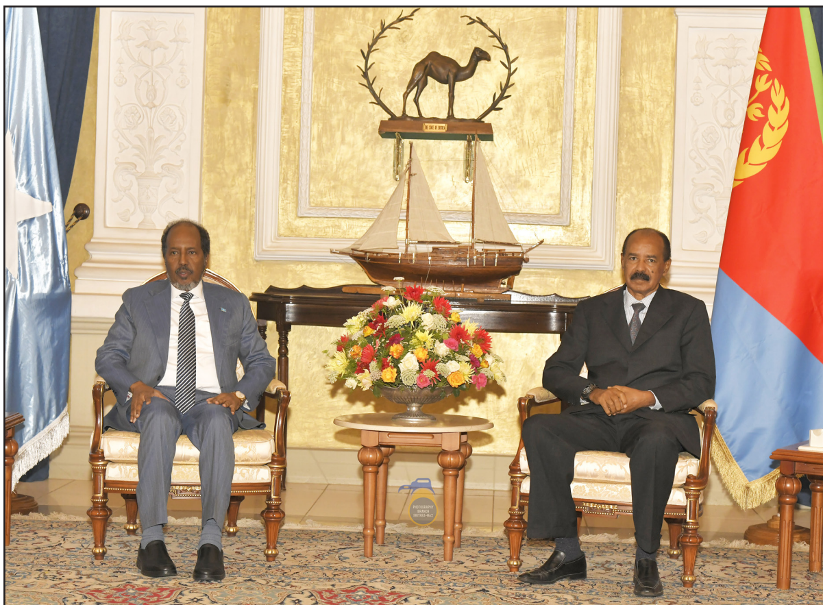
President Isaias Afwerki and President Hassan Sheikh Mohamud of the Federal Republic of Somalia held extensive discussions at the State House on 8 July focusing on strengthening bilateral ties and other matters of mutual interest. President Isaias invoked the

historical ties between Eritrea and Somalia and emphasized the imperative of consolidating robust and all-rounded bilateral relations that advance the interests of both peoples, especially in the political, security, military, economic, cultural, and social sectors.