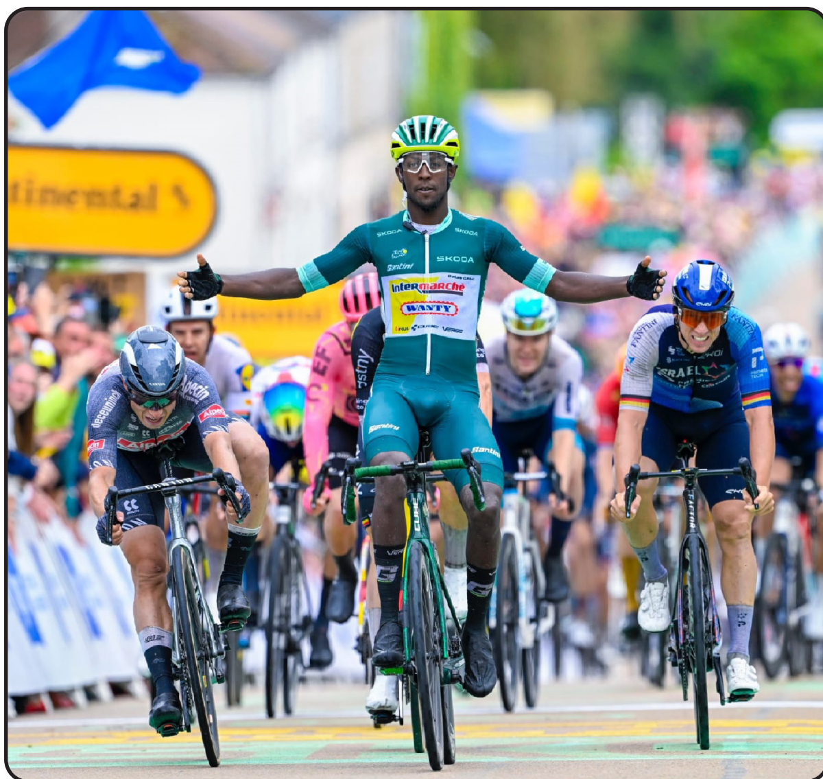
Biniam and Jasper.

The lead out by his team was perfectly timed, having paved the way for him to secure 17 points in the intermediate sprint in Lamargelle and subjecting Philipsen to 4th which helped Bini extend his points classification to a whopping 216 points; in the last kilometer Intermarché - Wanty took over, guiding Bini to position himself expertly for the final sprint. Although, Bryan initiated his sprint early, he was overtaken by both Jasper and Bini. In the final few meters, it was down to two sprinters,