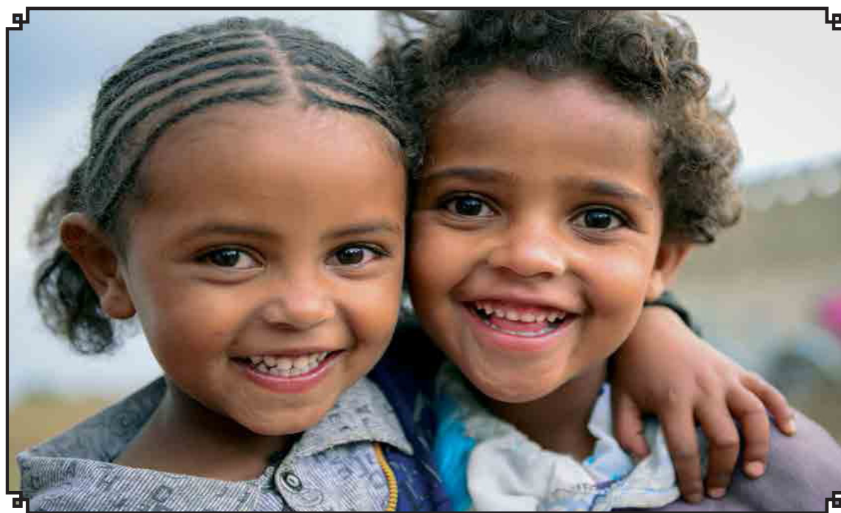
Children's rights: a moral imperative and important investment

As outlined in the insightful articles by the UNDP and the MLSW, Eritrea, despite facing many obstacles and significant challenges, has made considerable progress in protecting children's rights and improving their welfare. At the same time, however, it is important to recognize that a great deal more remains to be done. Safe, healthy, happy, and well-educated children are the foundations of sustainable development and a bright future. In order for Eritrea to develop in a sustainable manner and establish a thriving, equitable society, it must work to ensure that the basic rights and needs of its children, particularly the poorest and most vulnerable, are met.