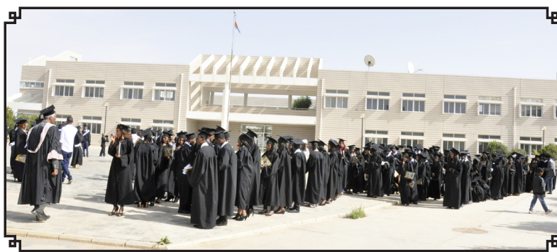
College of Arts and Social Sciences (CASS)

Furthermore, a large body of research suggests that integrating arts, music, education, and extra-curricular activities helps develop the whole brain, promote imagination,