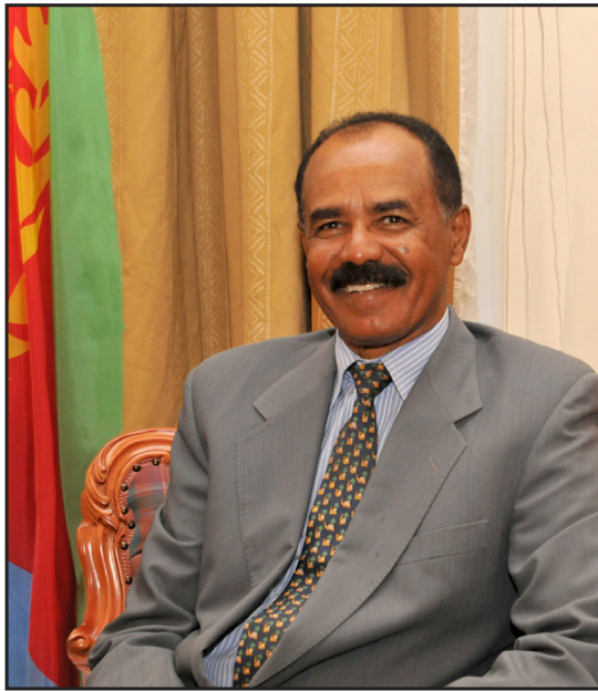
Independence Day anniversary.

In the same vein, the leaders of Kuwait, Malta, Nicaragua, Qatar, Serbia and Paraguay as well as the General Secretary of the United Nations have extended their congratulations to the people and Government of Eritrea on the occasion of the 33rd