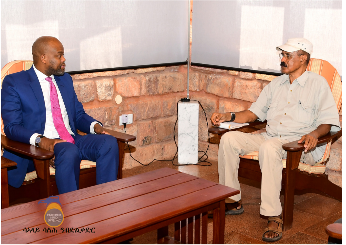
የአሳይ ሳልክ ዓብይ አባይ

አገራችንን ምን ዓይነት ጥበቃ ለማግኘት የሚችል አህጉር አፍሪቃ እንዲሆን ማድረግ አለብን።