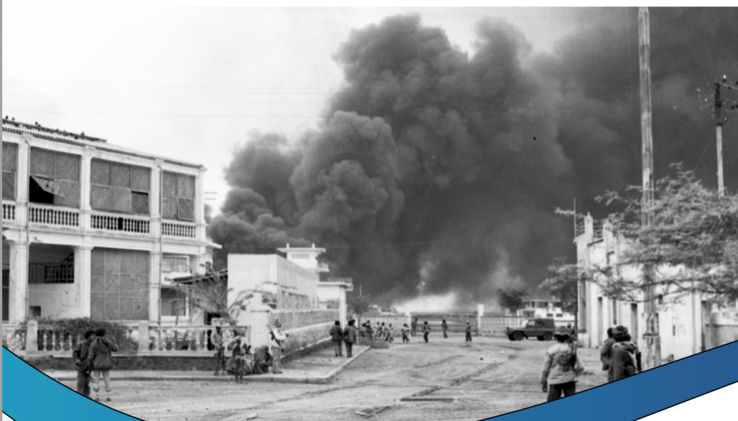
ሰዎች ስርዓት - ሰዎች ስለ ልላይ