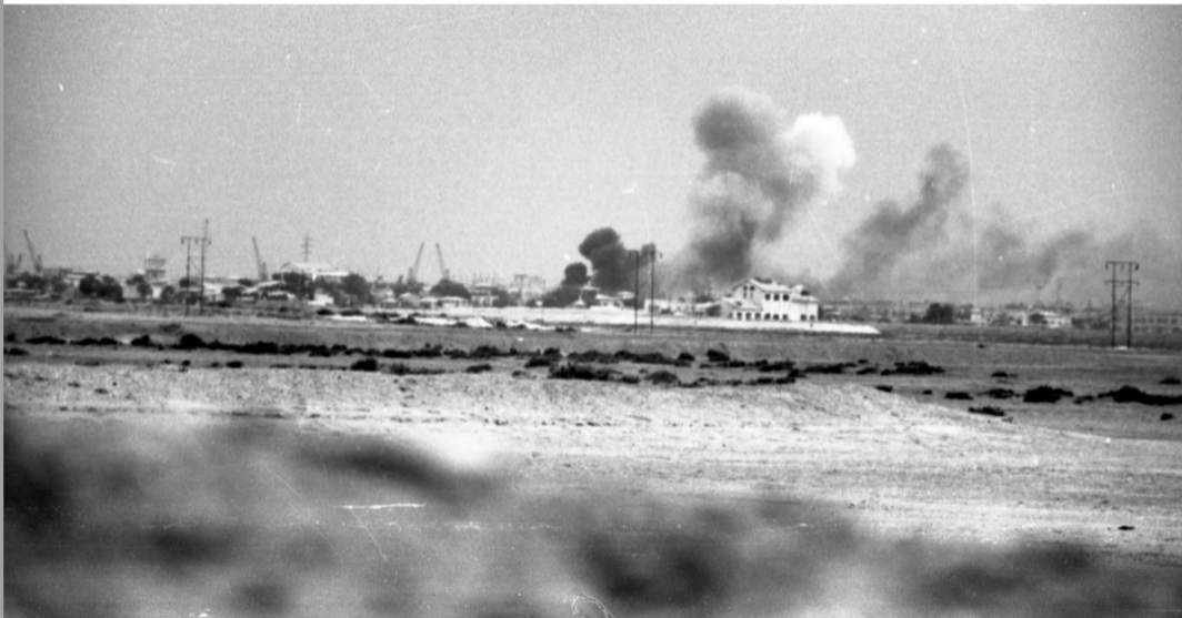
አብ ስርዓት ስርዓት ውጥረት ደርግ