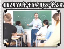
በዘጠነ ሰባት ተሰፋ ዘመናዊ ሪፖርት