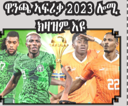
የግልጽ ልግራ 2023 ሎጊ ክብር ላይ