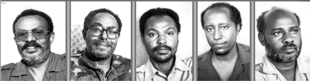
ሰርዓት ደርግ ስለ ልላይ