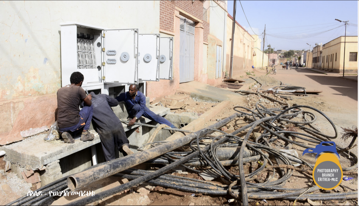
መስመር ስለሚገነባበት ቦታ ላይ ጥራጥራ እና ለውጫዎች የሚያስፈልጉትን ስጦታዎችን ለማግኘት ተሞክረዋል።

ልክሶ ኮሚሽን ለሚያዝያ 13 መደብ 2002 ከግዛቱ ጋር ተወያይቶ የገንዘብ መዋዕል ቴሌፎን ብሓድሽ ይታካኝ ከግዛቱ ማህበረ ሰባተኛው አባቶቹን ጥቅም ላይ ይውላል። ልዕሊ 70 ዓመታት ዕድሜ ያላቸው ገደብ ጎንደር ባይታዊ መስመር ተጠናቆ የገንዘብ መዋዕል ቴሌፎን ብሓድሽ ይታካኝ ከግዛቱ ማህበረ ሰባተኛው አባቶቹን ጥቅም ላይ ይውላል።