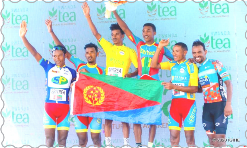
ኣርማክ ዳግላ ህርግ ምዃር

ወልቆም ሃርን ማይ ኮምፕዩተር ስብሰባ ኣለዎ። ንተቆይታ ለማድረግ ክትገቡ ኣለዎ። ምክንያቱ ኣብ ቅድመ-ገንዘብ ብኸኸተ ወይንት ስብሰባ ኣብቲ ዓውዲ ኮምፕዩተር ክገብር ክትገቡ ይገባዎም።