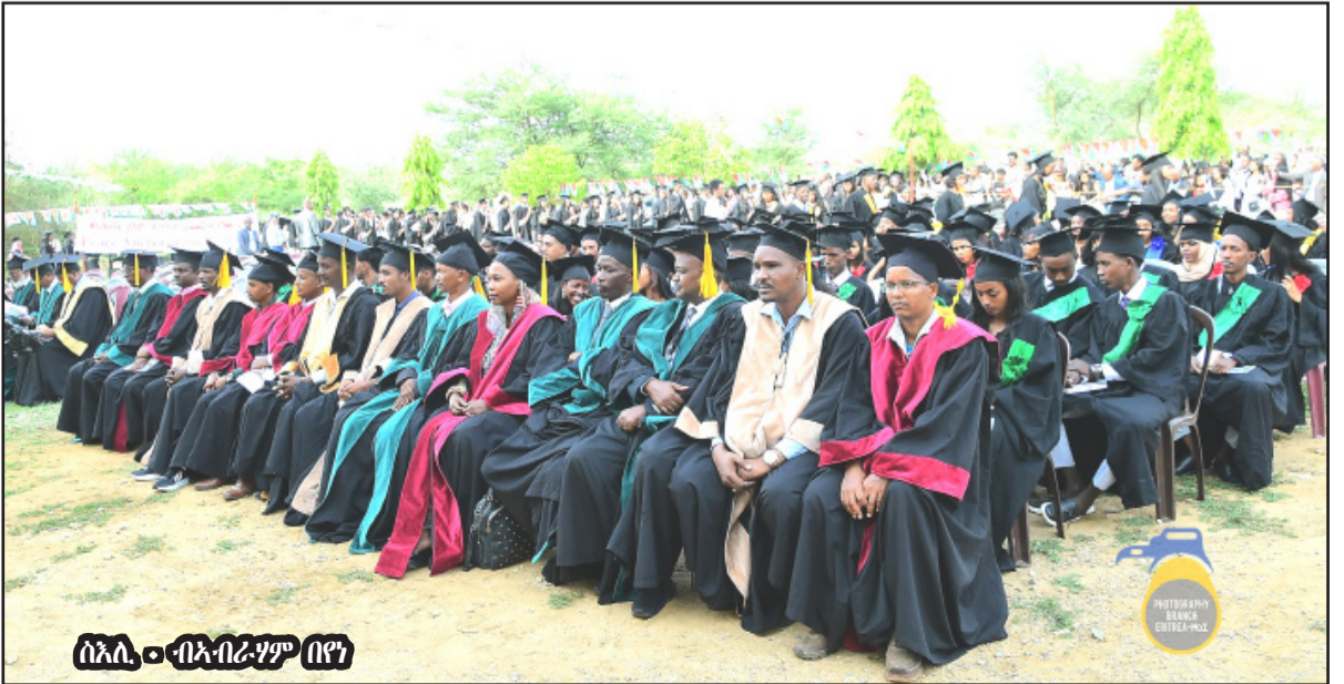
ሰኢሊ - ብሳይያስ ምንጽቱ ገለጹ