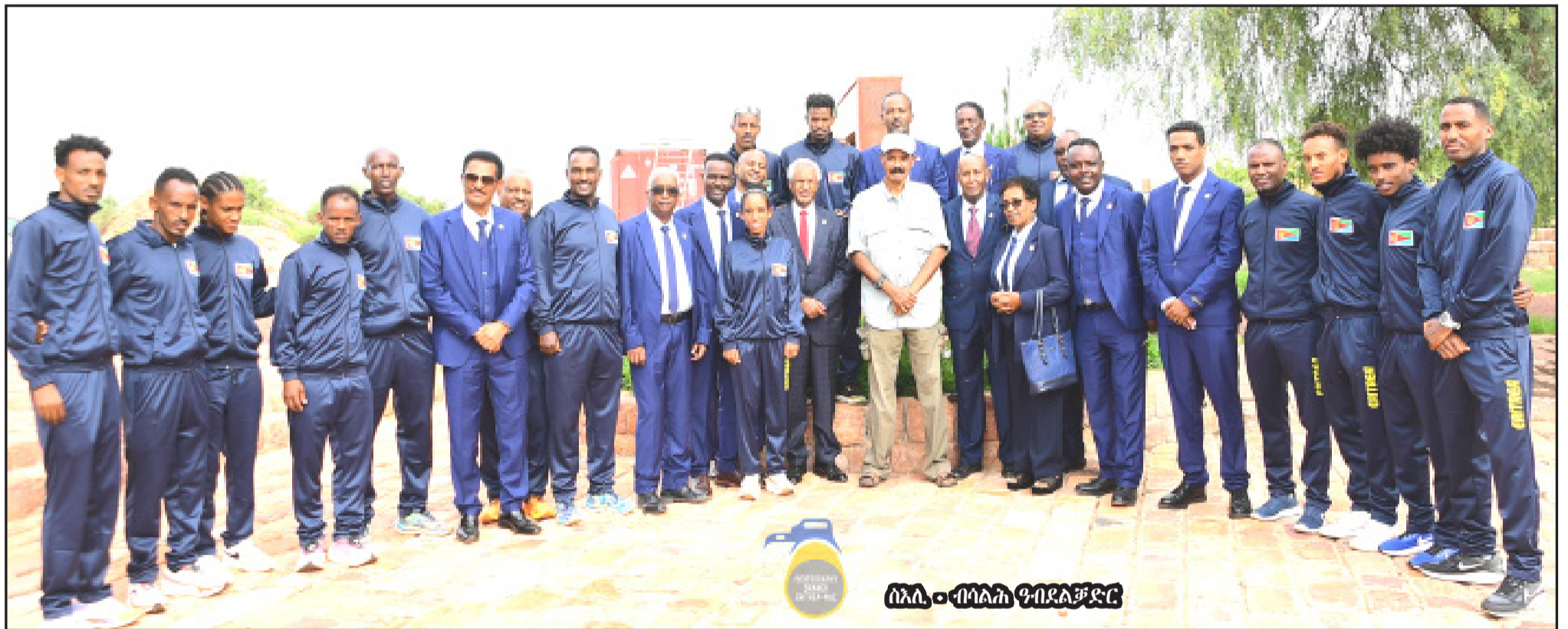
ሰኢሊ - ብሳይያስ ምንጽቱ ገለጹ

ፕሮጀክት ኢሳይያስ ኣፈጻጸሙ ኣብ ውድድራት ኣሎምፕክ ጋንታ ኣርገራ ገጹ። ኣብ ሰባት ግሥ ኣብ ዓይኡ ተቐብሎ ሰናይ ምንጽቱ ገለጹ። ኣብቲ ኮሚሽን ባህርን ስፕርትን ኣምሳይ ዘመደ ተክሎ ኮሚሽን ኣብዮት ፈጻሚነት ሃገራዊ ኮሚሽን ኣሎምፕክ ዝተረጎሙ ስራታት፡ ፕሮጀክት ኢሳይያስ ኣብዞም ቅጽጽ፡ ዘሎ ውሳኔ ናይ ስፕርት ሃገራዊ ሰናይ ምንጽቱ ገለጹ።